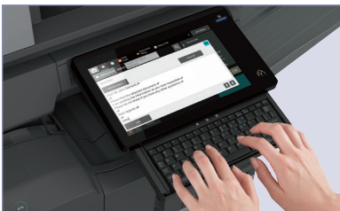
Built-in retractable keyboard simplifies email address and subject line entries.