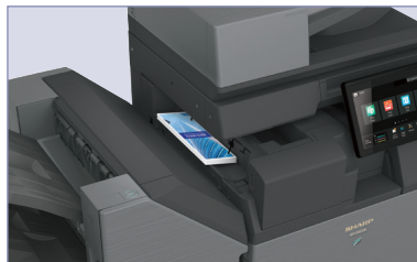
New Inner Folding Unit option offers a variety of fold patterns, including tri-fold, z-fold and others.