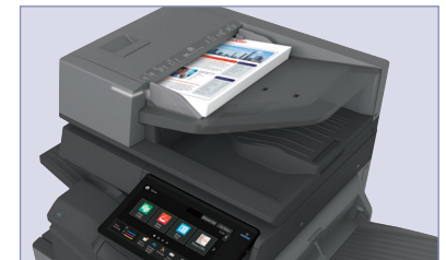
High capacity 300-sheet DSPF scans documents at up-to 280 images per minute.