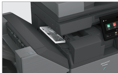
New Inner Folding Unit option offers a variety of fold patterns, including tri-fold, z-fold and others.