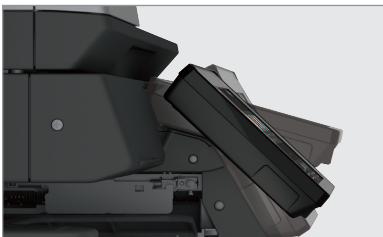
Pivoting Touchscreen offers the viewing angle for any use instantly.