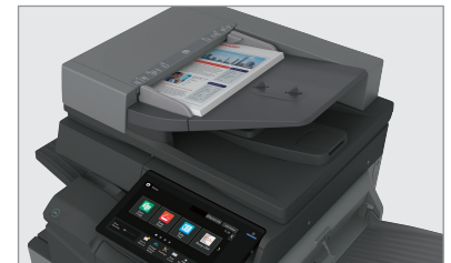
100-sheet RSPF scans documents at up-to 80 images per minute.