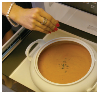
GENEROUS 17" x 16" interior is perfect for platters, casseroles & serving bowls.