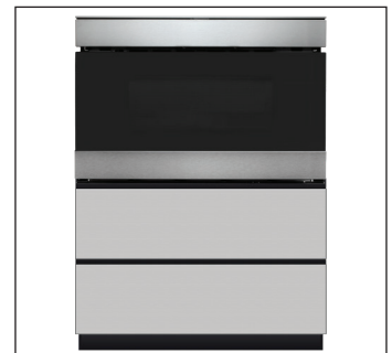
PEDESTAL ACCESSORY slides under the counter for hassle-free installs.