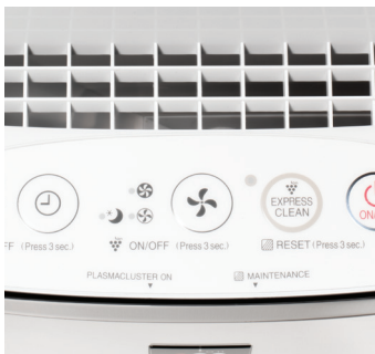
Patented Plasmacluster® Ion Technology reduces germs, bacteria, viruses, mould & fungus

"Plasmacluster Express Clean" gives you sixty minutes of high-density Plasmacluster Ion production and high-fan speed for an extra boost of clean when you need it, and a hands-free return to the prior mode when complete. The unit has LibraryQuiet™ operation (as quiet as 22 decibels, or the sound of rustling leaves) and is ENERGY STAR® rated, so you can run the unit continuously while saving money and energy.