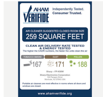
Sharp Air Purifiers are tested by independent laboratories to verify the air-cleaning capability of the filtration system