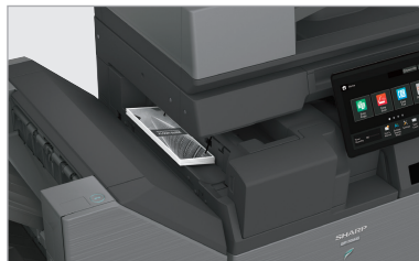
New Inner Folding Unit option offers a variety of fold patterns, including tri-fold, z-fold and others.